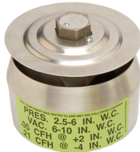
This component was tested to and met the following criteria: